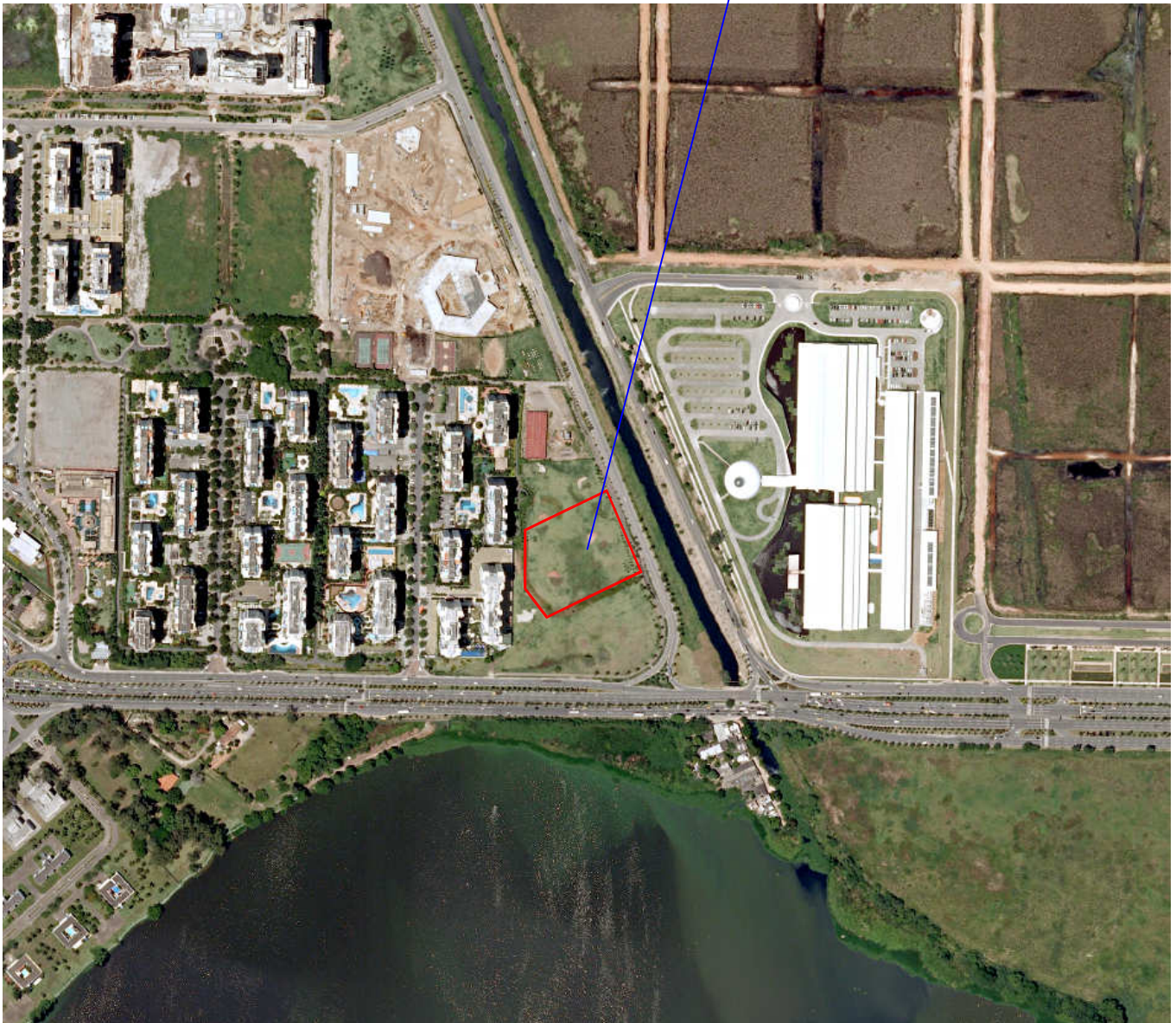
Dimensões e Área de acordo com o PAL 44.069